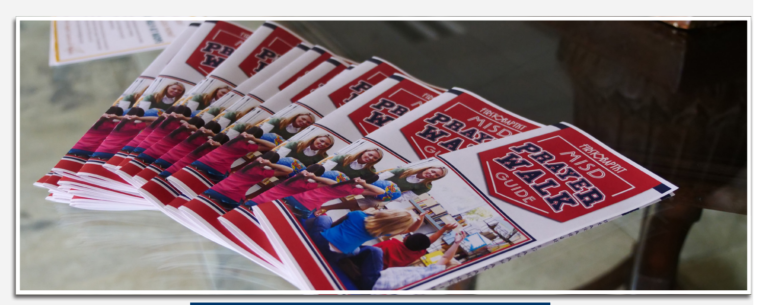
Prayer Walk Guides are located on tables in the foyers.